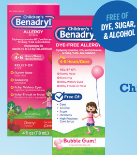
Children's BENADRYL® Allergy Liquid†‡