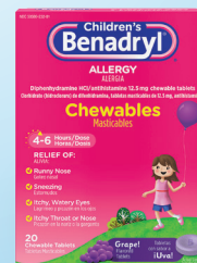
Children's BENADRYL® Chewables†